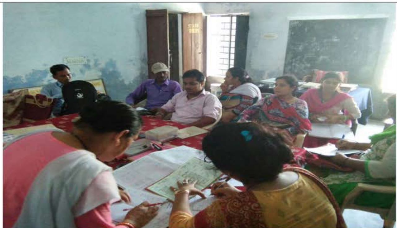
Verification of Registers by the Social Audit team in a School in Umerkurd