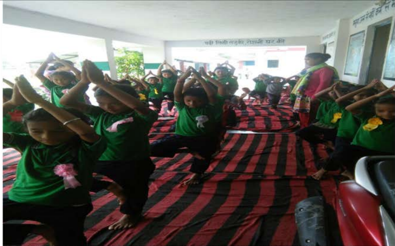
Students in Yoga class during the visit of social audit team in a school, Chanda GP