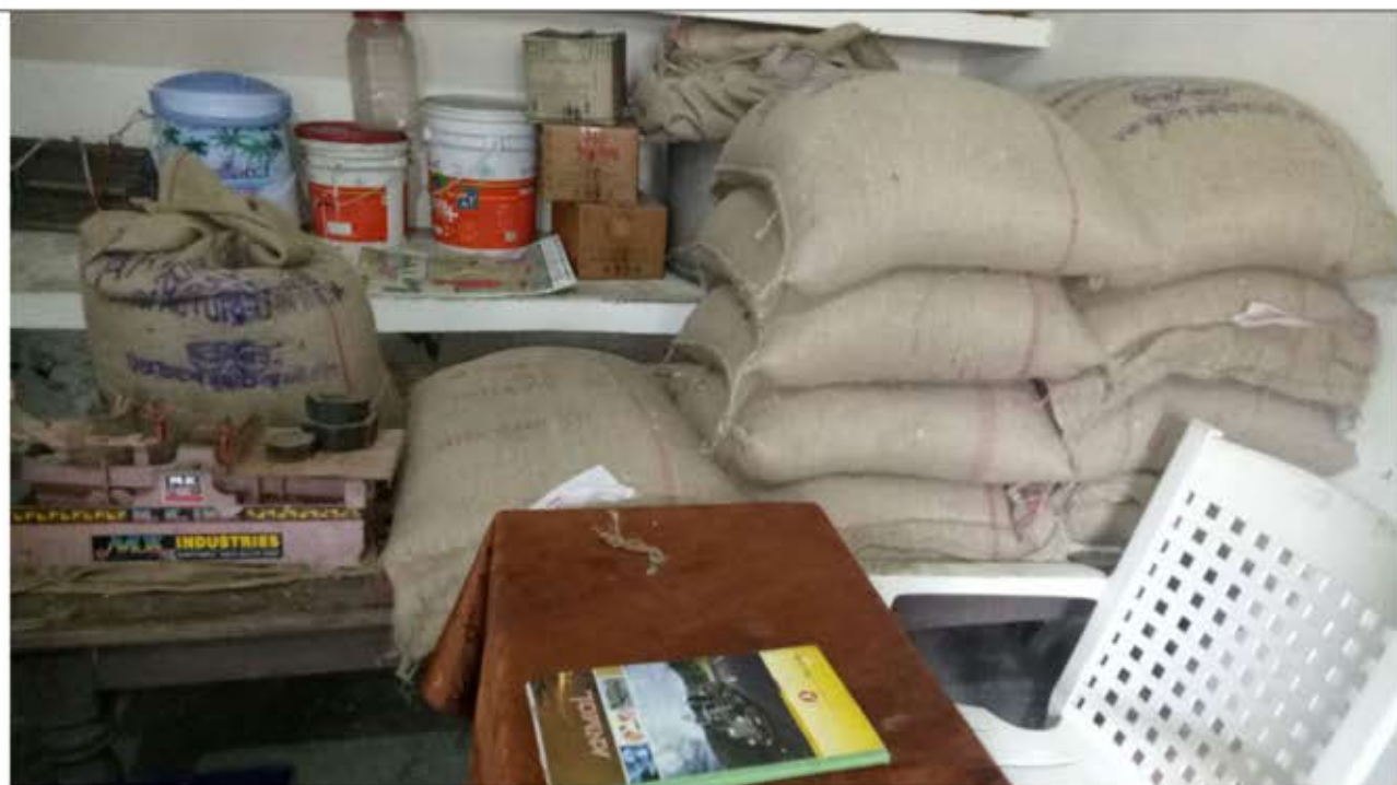
Store room- Grains and other cooking ingredients