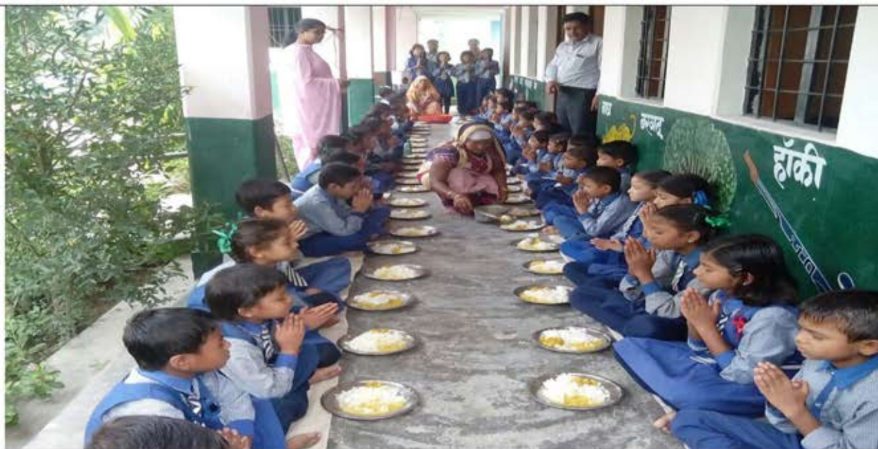
Students praying before having MDM