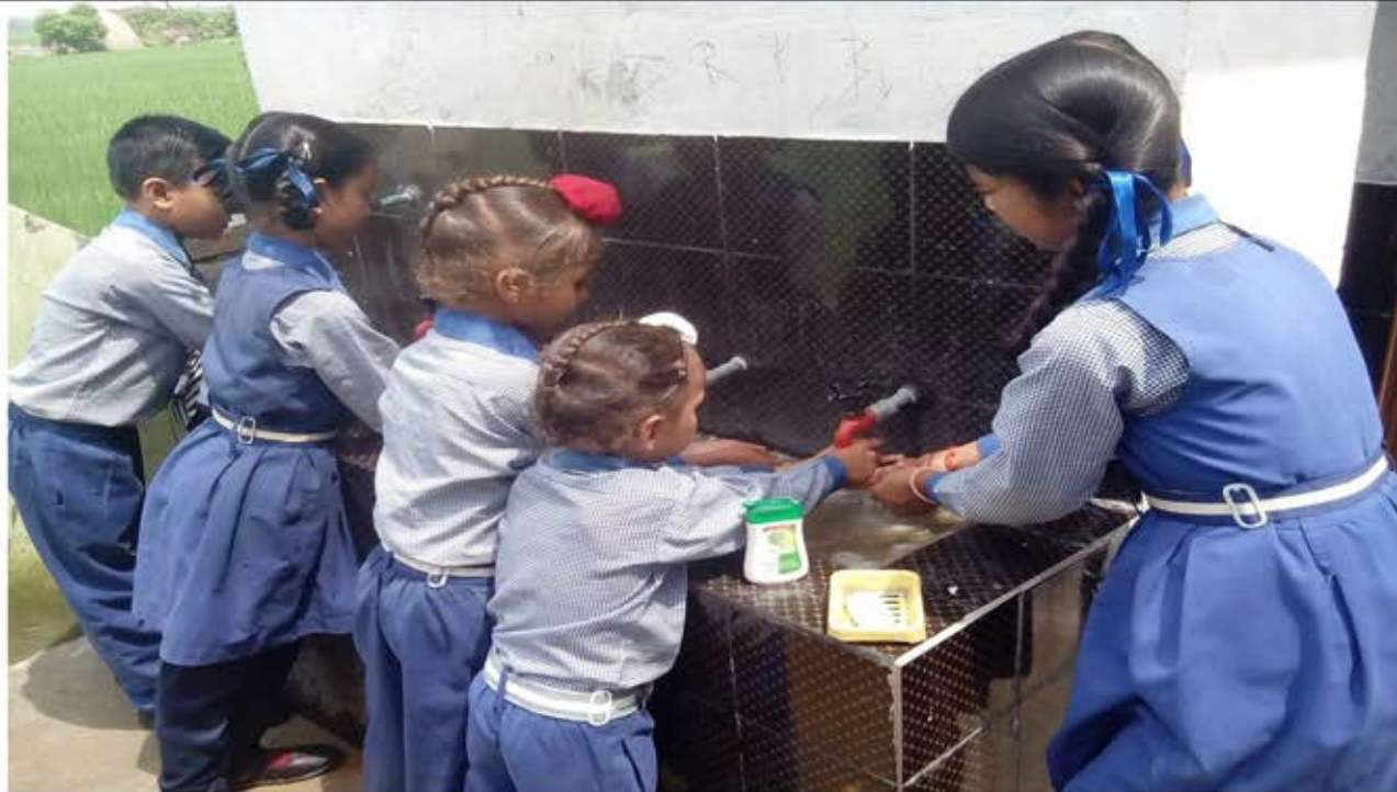
Students washing hands in a well-constructed washing area