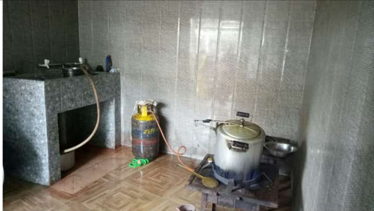
Well Maintained Kitchen Shed in a School