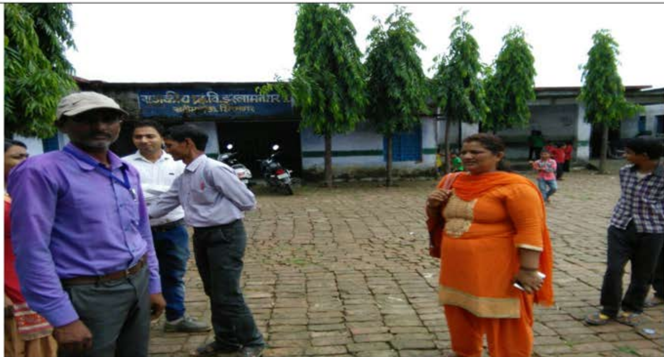
Social Audit Team in GPS- Islamnagar