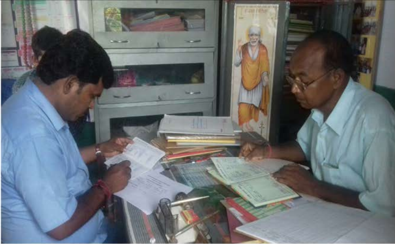
School registers verification by the social audit resource person]