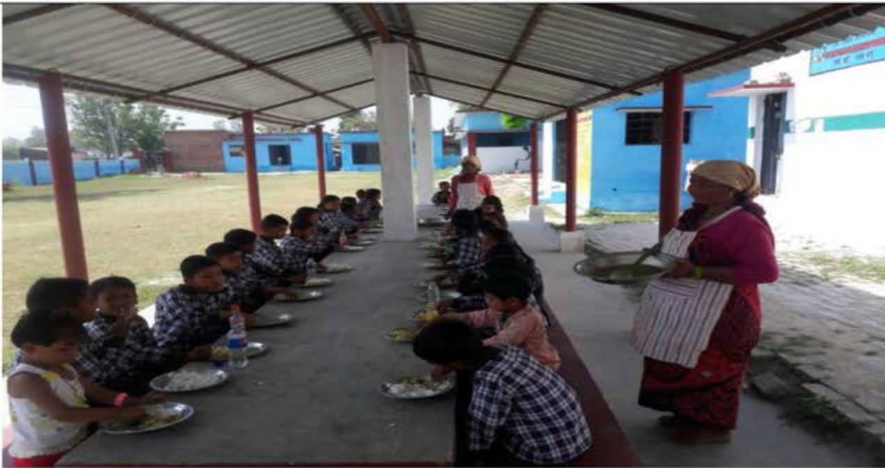
Students having MDM in GPS- Chanda.