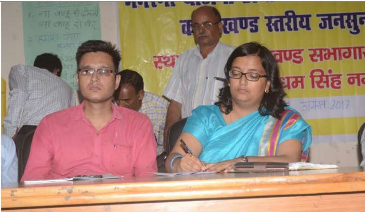
MDM District Coordinator, Udham Singh Nagar and Dy. Educational Officer- Khatima in Block Public Hearing