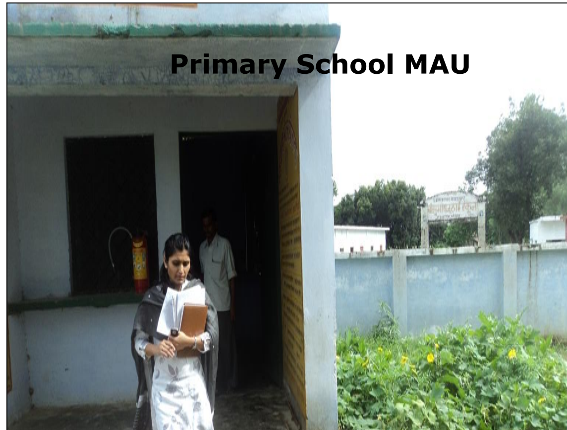
Primary School MAU