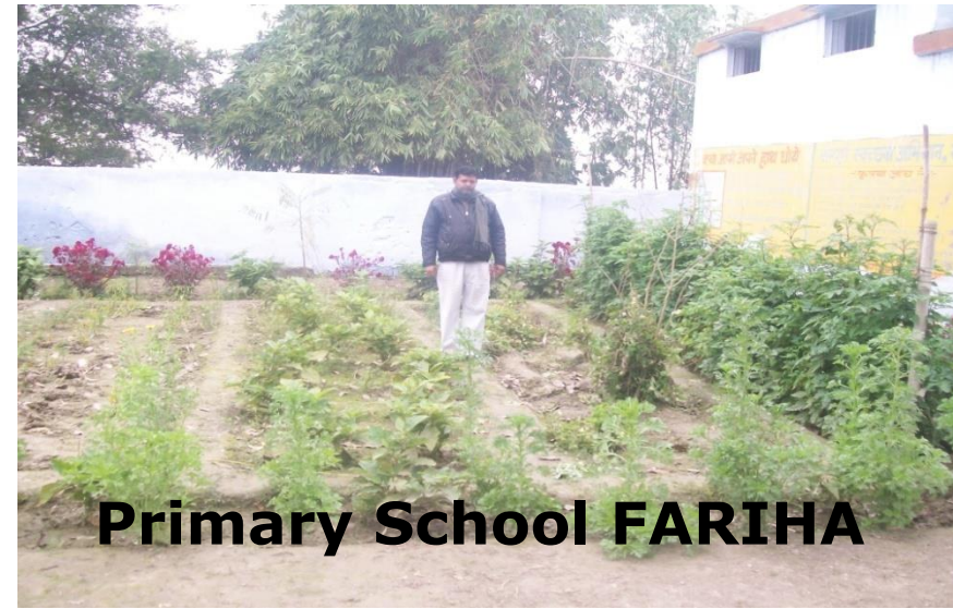
Primary School FARIHA