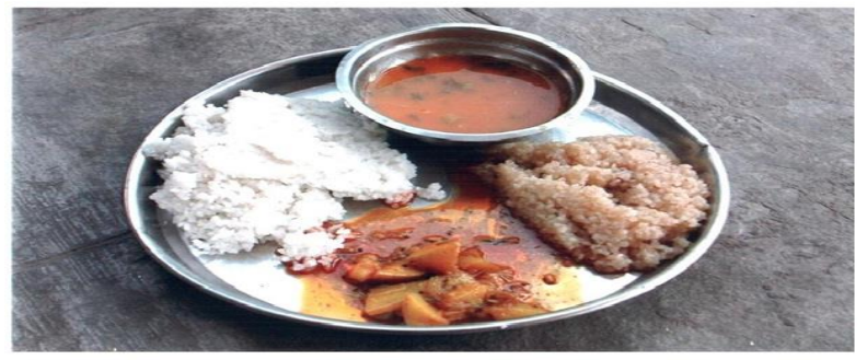
Mid Day Meal, Gujarat