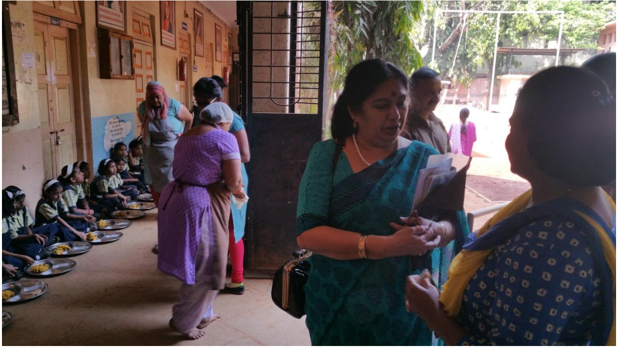
LT. VIDHY NIKETAN GOAATE PRIMARY SCHOOL SERVING MEAL TO STUDENTS