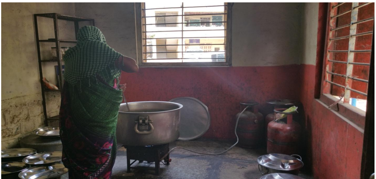
AVAILABILITY OF COOKING GAS