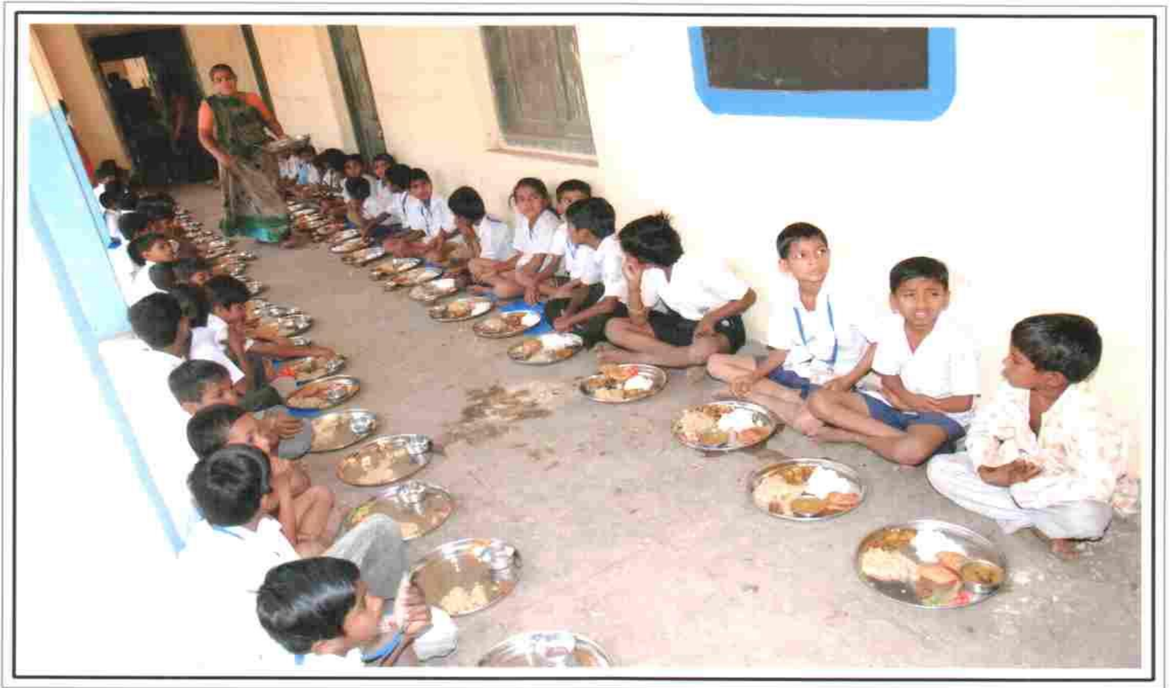
Tithi Bhojan with Sweets from Community Leader in Manej Primary School, Ta-Petlad, Dist-Anand