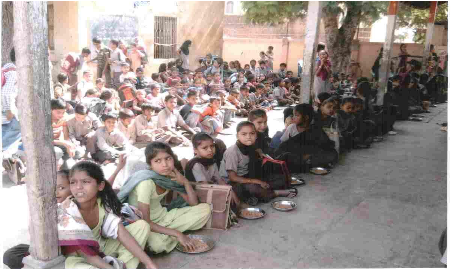
Complementary Sweets Dist-Bharuch, Center No.45, Ta- Aamod